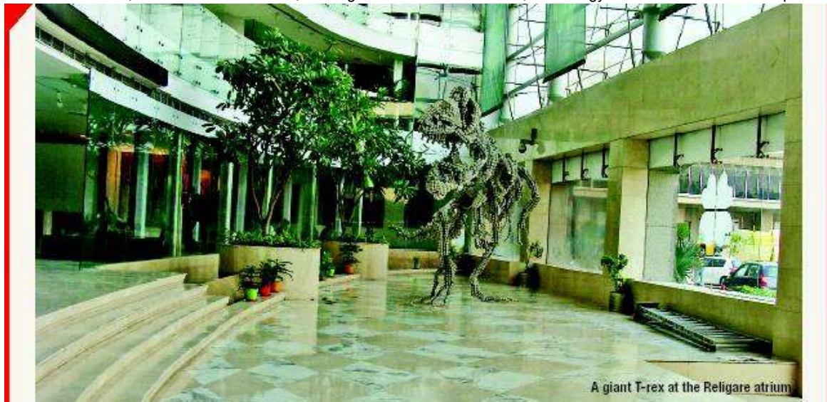
A giant T-rex at the Religare atrium